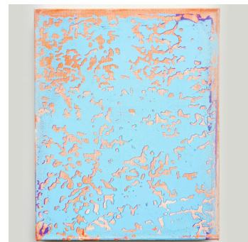
Stephen Maine 5 — 29 Apr 2018